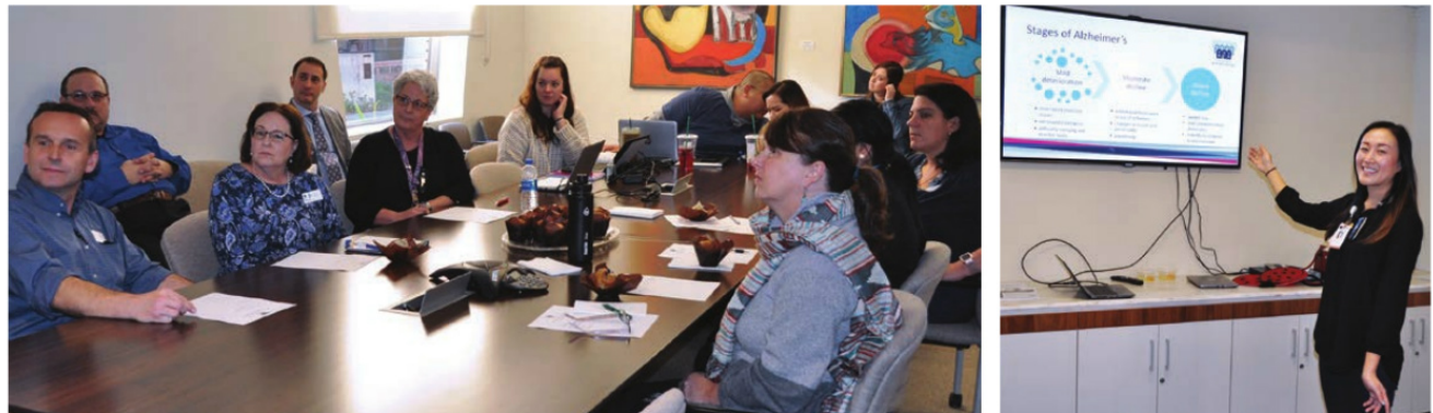
Pictured above: Utilizing funds from the Gilbert Foundation, the Home offers dementia training sessions to other non-profit senior organizations such as Front Porch.